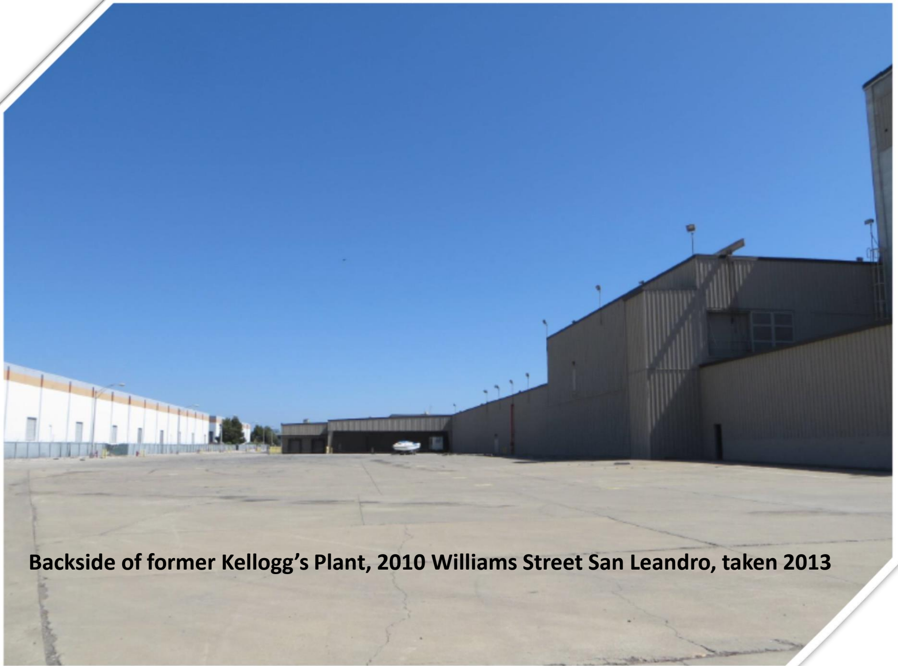
Backside of former Kellogg's Plant, 2010 Williams Street San Leandro, taken 2013