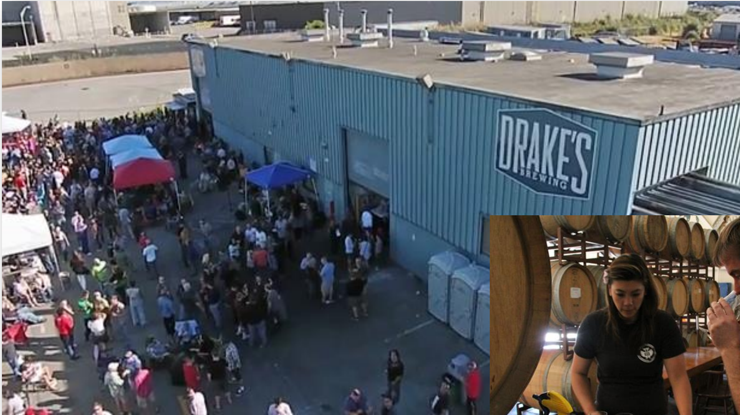
Drake's Barrel House The Gate (25 years)