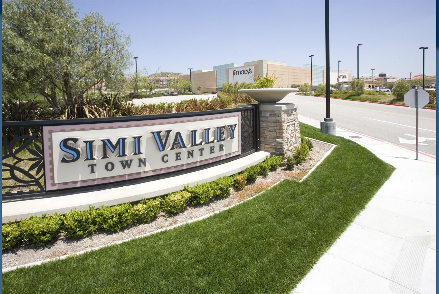
Simi Valley Town Center