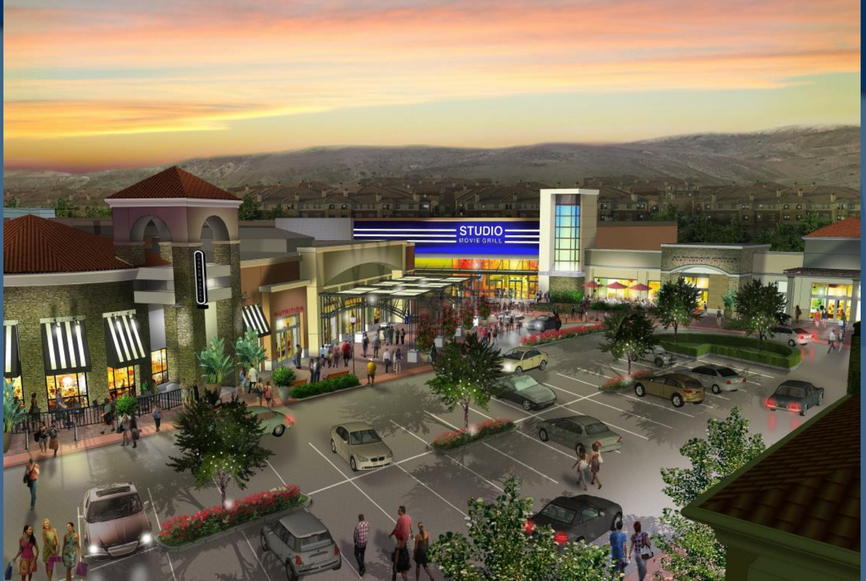
Simi Valley Town Center