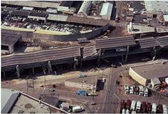
San Francisco Earthquake - 1989