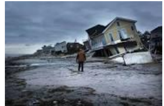
Superstorm Sandy - 2011