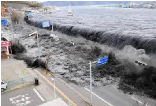
Tohoku Earthquake & Tsunami - 2011