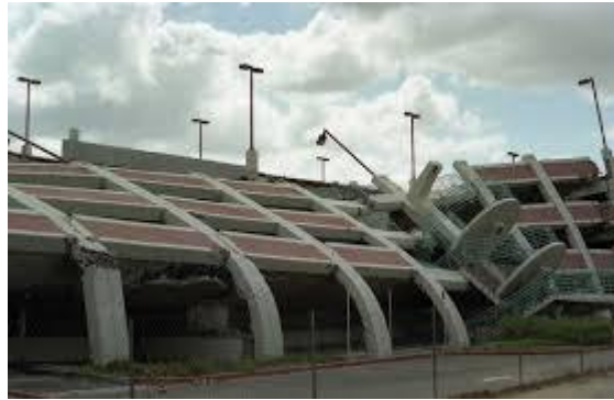
Northridge Earthquake - 1994