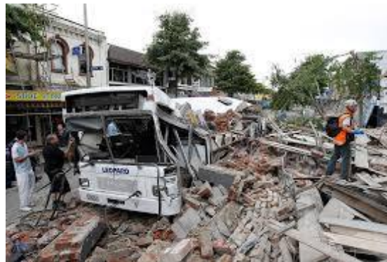
Christchurch Earthquakes – 2011