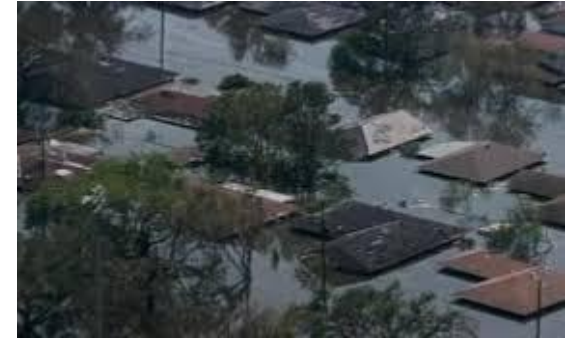
Hurricane Katrina - 2005