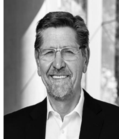
Donald Braun Hall Financial Group