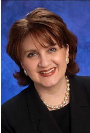
Veletta Forsythe Lill Dallas Arts District Dallas City Council