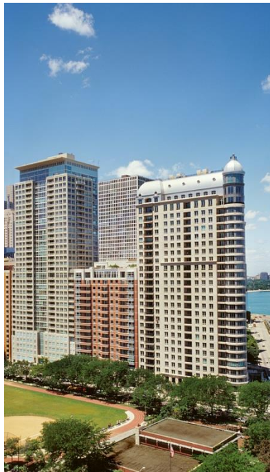
RESIDENCES ON LAKE SHORE PARK