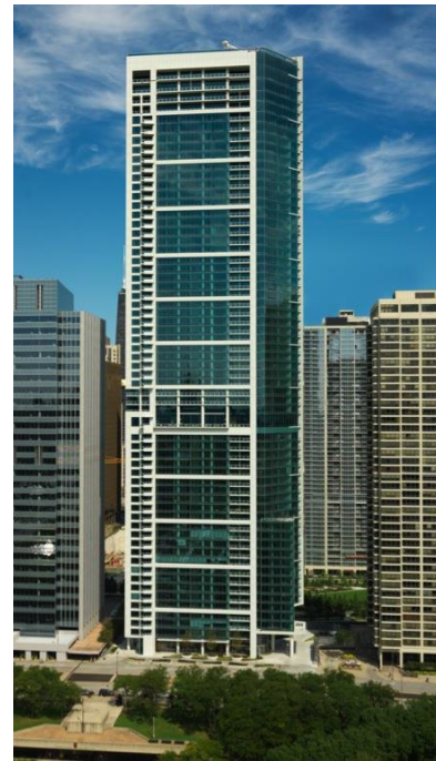
340 ON THE PARK