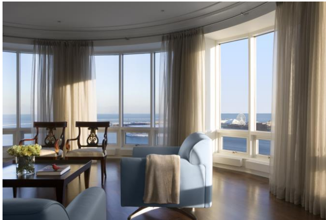
840 N. LAKE SHORE DRIVE