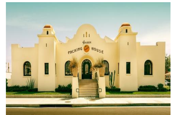
Anaheim Fresh: The Packing House