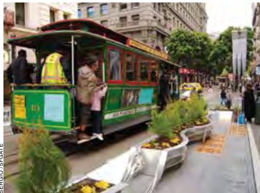
SERGIO / SFGATE