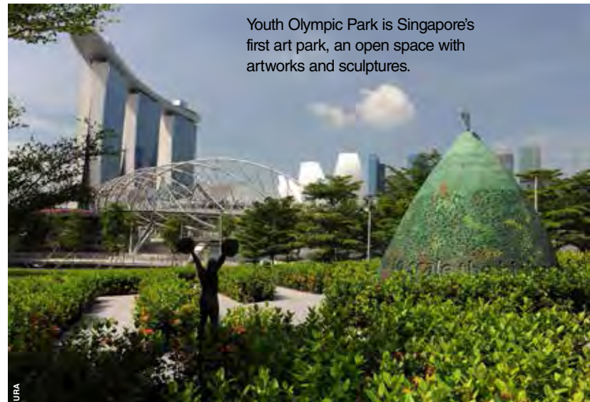
Youth Olympic Park is Singapore's first art park, an open space with artworks and sculptures.

Marina Bay is linked to an extensive transportation network. The development parcels at Marina Bay were planned based on a grid pattern that extends from the existing road network within Singapore's central business district. Visitors can easily access Marina Bay by way of multiple public transportation stations