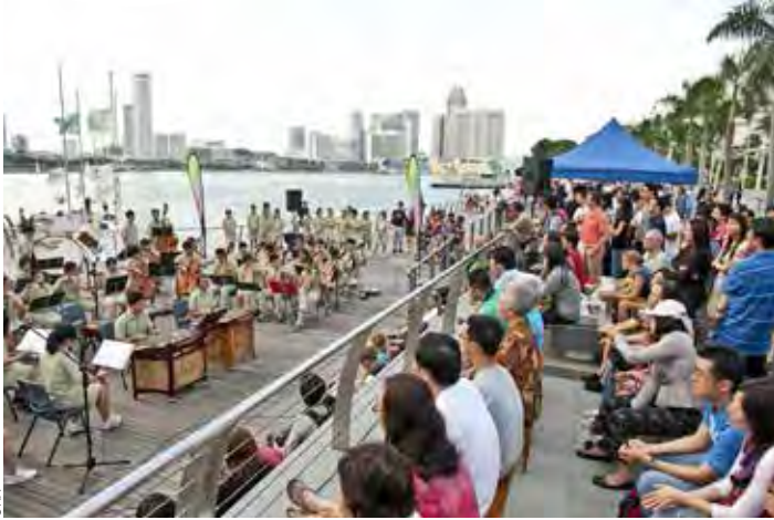
Above left: The lower-level boardwalk allows for activities such as concerts to take place, bringing the community to the waterfront.