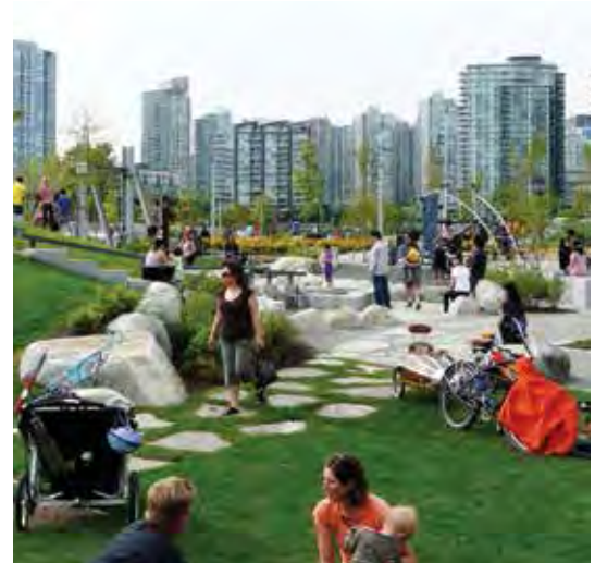
PWL PARTNERSHIP LANDSCAPE ARCHITECTS INC.

Top: A new urban form emerged by marrying naturalized and built environments, creating a true sense of place in the Village.