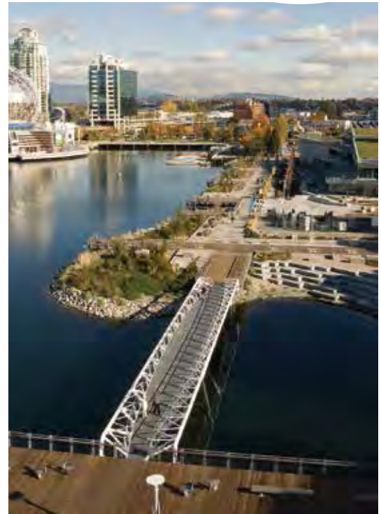
PWL PARTNERSHIP LANDSCAPE ARCHITECTS INC.

Located on a previously industrialized 32-hectare (79 ac) waterfront site in Vancouver, the Parks and Waterfront at Southeast False Creek articulates the public realm for Vancouver's premier sustainable neighborhood. Through the introduction of restored natural environments into a highly urban community, the project exemplifies a new green infrastructure-based approach to creation of the public realm. The open spaces—composed of Hinge Park, Habitat Island, a 650-meter-long (2,132 ft) continuous waterfront park, and neighborhood streets—provide multiple and varied recreational opportunities while acting as kidneys for the neighborhood, cleansing stormwater runoff before it reaches the ocean.