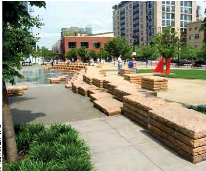
PWL LANDSCAPE ARCHITECTURE

But the story is different on the west side, where 700-acre (283 ha) Druid Hill Park was at one time the city's premier pleasure ground, surrounded by large apartment buildings and a dense fabric of fashionable brownstones. Because of severe neighborhood decline, the periphery today is a sad mixture of old buildings, vacant land, and a few new gated developments.