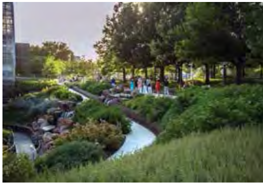
MYRIAD BOTANICAL GARDENS

Visitors enjoy a walking tour along safe, lushly landscaped and lit walkways with winding streams and a rock waterfall.