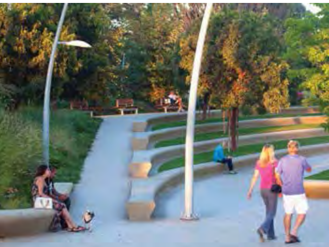
Above: Seating terraces shaded by strawberry trees compose Gathering Hill, which is the social and civic heart of the park. The seating terraces function well for casual gatherings as well as for formal events such as Santa Monica's Jazz on the Lawn.

As a whole, the project offers a new model of sustainability for similarly scaled projects, one that carefully balances environmental and cultural considerations. From abandoned parking lots to the largest-scale Mediterranean meadow garden of its complexity in a public space, Tongva Park and Ken Genser Square have restored valuable ecosystem services and social vitality to a once derelict and degraded urban site.