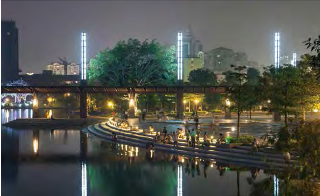
Left: Designed to transition from day to night, the so-called City of Lights Thousand Lantern Lake Park features signature lighting designs at Culture Plaza that function as beacons in the dark.