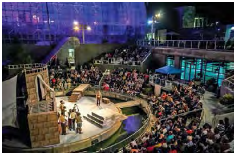
MYRIAD BOTANICAL GARDENS

The renovated outdoor water stage is the summer home to the nonprofit Oklahoma Shakespeare in the Park and hosts other performances, weddings, awards ceremonies, and demonstrations.