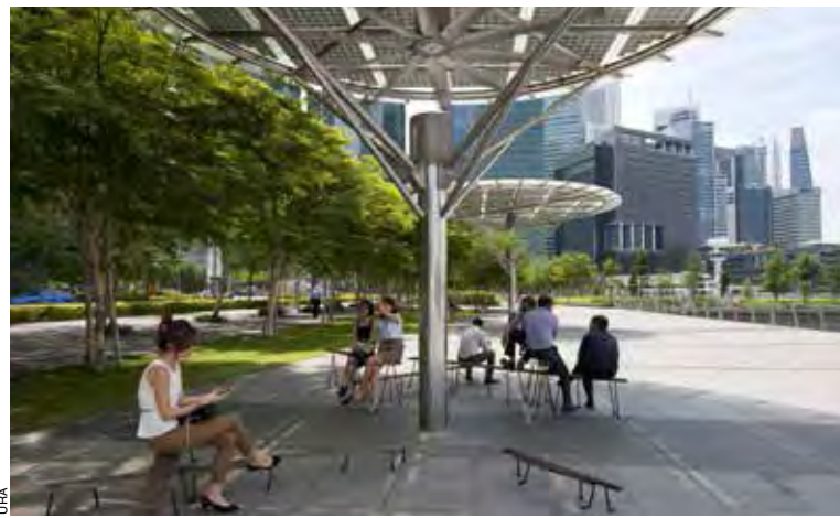
Above right: Breeze shelters along the upper-level promenade create pavilions for pedestrians to rest and gather.

and a system of cycling lanes. Marina Bay is also linked to the city by a vehicular bridge and the longest pedestrian bridge in Singapore. Pedestrians stroll through the signature double-helix design as they enter Marina Bay via the bridge.