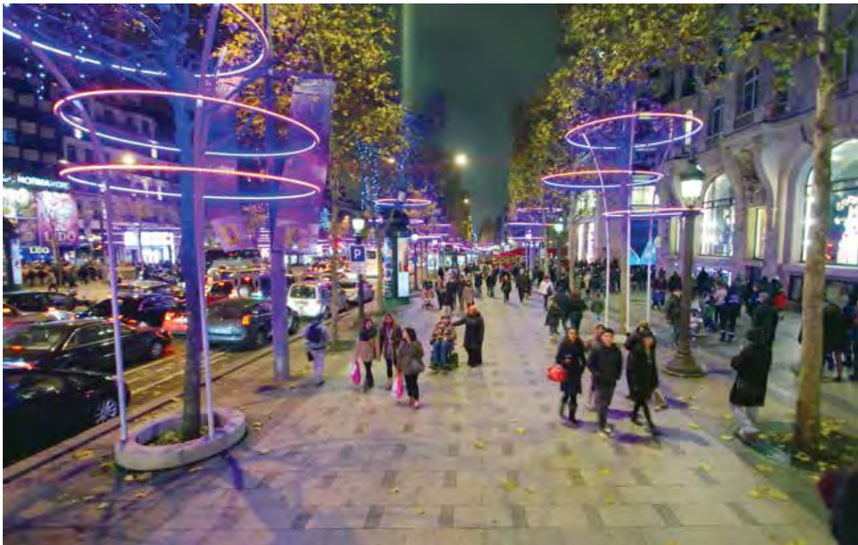
FREDERIC BISSON, LIGHTING AT AVENUE DES CHAMPS-ÉLYSÉES, 2013