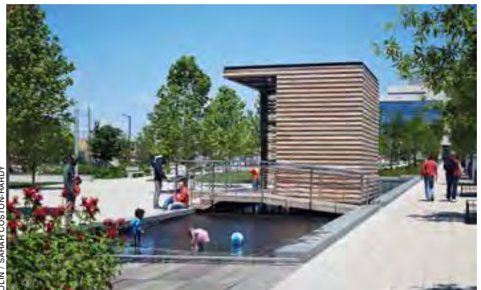
OLIN / SAHAR COSTON-HARDY

Above: The middle block pavilion doubles as a stage for children's music and theater and appears to float on a thin film of water, which creates a quiet area of play and respite for the park's youngest visitors.