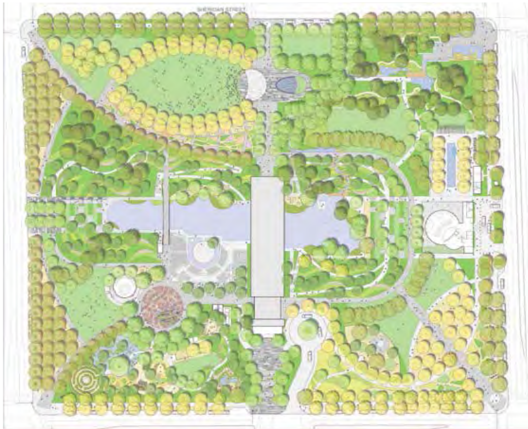
DOB Vision plan.

The 15,000-square-foot (1,400 sq m), 224-foot-long (68 m) Crystal Bridge Tropical Conservatory that stretches across the middle of the property is surrounded by a sunken lake, shrubs, flowers, and the outdoor water stage amphitheater. The living-plant museum features palm trees, tropical plants and flowers, waterfalls, and exotic animals. In addition to Crystal Bridge, several pieces of art are distributed throughout the gardens. Visitors can walk beneath the “Philodendron Dome” on the northwest side of the lake for views of iron vines woven into an iron-and-bronze dome. On the west side of the Myriad Botanical Gardens is a colorful