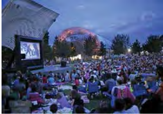
MYRIAD BOTANICAL GARDENS

Thousands of visitors pack the Myriad Botanical Gardens during summer movie nights featuring a renovated great lawn, the band shell, a food truck area, picnic and al fresco dining areas, and safe lighting around the tree-lined perimeter.