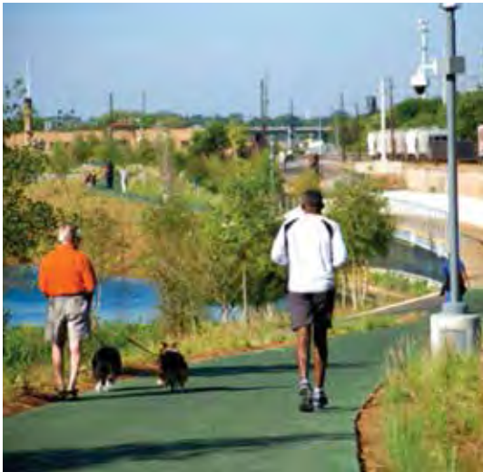
TOM LEADER STUDIO

Project sponsor and designer: James Corner Field Operations