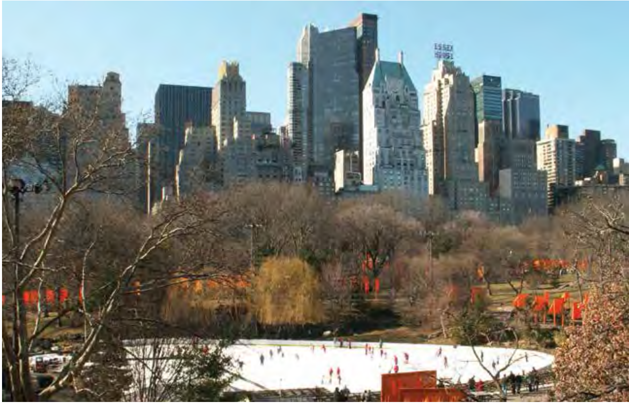
UWE KEMPA, THE GATES, 2005