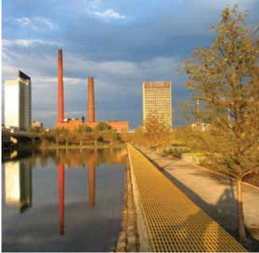
TOM LEADER STUDIO

Railroad Park occupies the historical seam created by a rail viaduct that bisects downtown Birmingham. The new topography integrates the train experience with a variety of new open-space activities that help organize and stimulate growth in the southern part of downtown while promoting connections north of the railroad. The park is the culmination of a long process of consultation and participation, including a 2002 ULI Advisory Services panel considering the entire downtown, followed by a new downtown master plan that identified key initiatives for growth and improvement. The resulting park is a model of integration, participation, and urban regeneration that will reward generations.