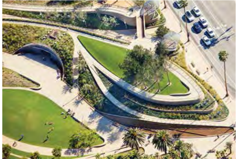
TIM STREET PORTER

Right: Observation Hill, which reaches a height of 18 feet (5.5 m), creates a dramatic platform from which one can take in views of the ocean and pier. It also serves to buffer noise pollution from Ocean Avenue, creating a quiet park interior.