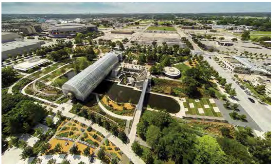
Aerial view showing the great lawn and bandshell, water stage and lake, multiple walkways, and landscaped areas.

The Myriad Botanical Gardens include a children's garden and playground, performance stages, a great lawn, interactive water features, an off-leash dog park, a seasonal ice rink, restaurants, multiple outdoor seating areas, landscapes filled with native plants, ornamental gardens, and more. Paths for walking and jogging serve as places for guests of all ages to find solitude in nature or connect with other community members. Park visitors can sit and enjoy the tropical scenery while listening to bubbling streams, and waterfalls blend into the sounds of the city. Should guests get hungry, the Park House restaurant is a welcoming indoor/outdoor, American contemporary restaurant with panoramic views of the Crystal Bridge and surrounding gardens.