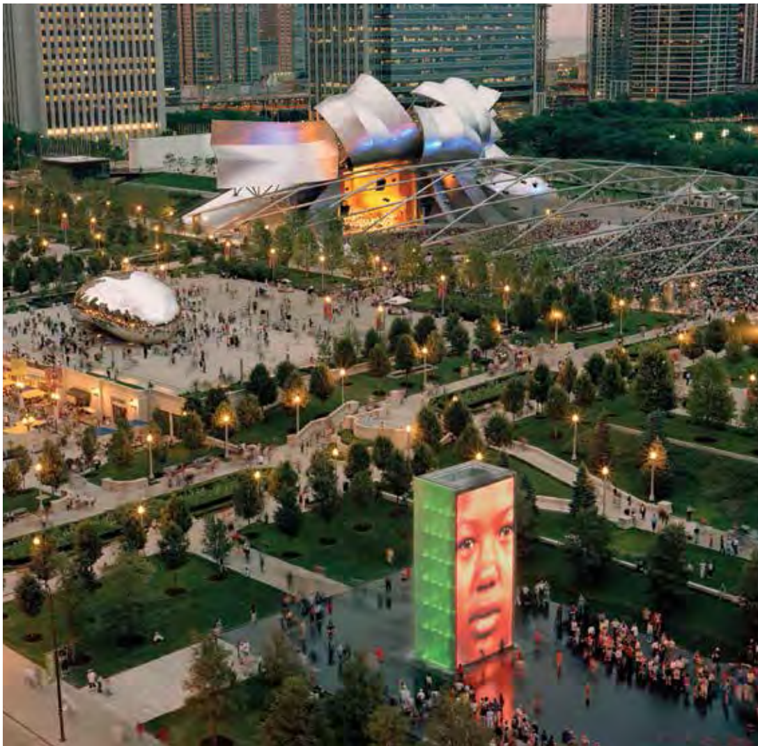
Partial aerial view of opening day, July 15, 2004, with the first 300,000 visitors.

IN 1998, MAYOR RICHARD DALEY established a partnership with Chicago's philanthropic community called the Millennium Park Foundation (MPF), a 501c3 not-for-profit corporation, and together they produced Millennium Park. Mayor Daley sliced through a red ribbon and officially opened the park on July 16, 2004. More than ten years later, the inventive park is a boon for art, commerce, and the cityscape. A first-time visit to Chicago is not complete without a stop at Millennium Park.