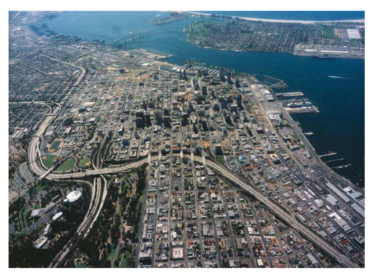
Transforming the East Village San Diego, California