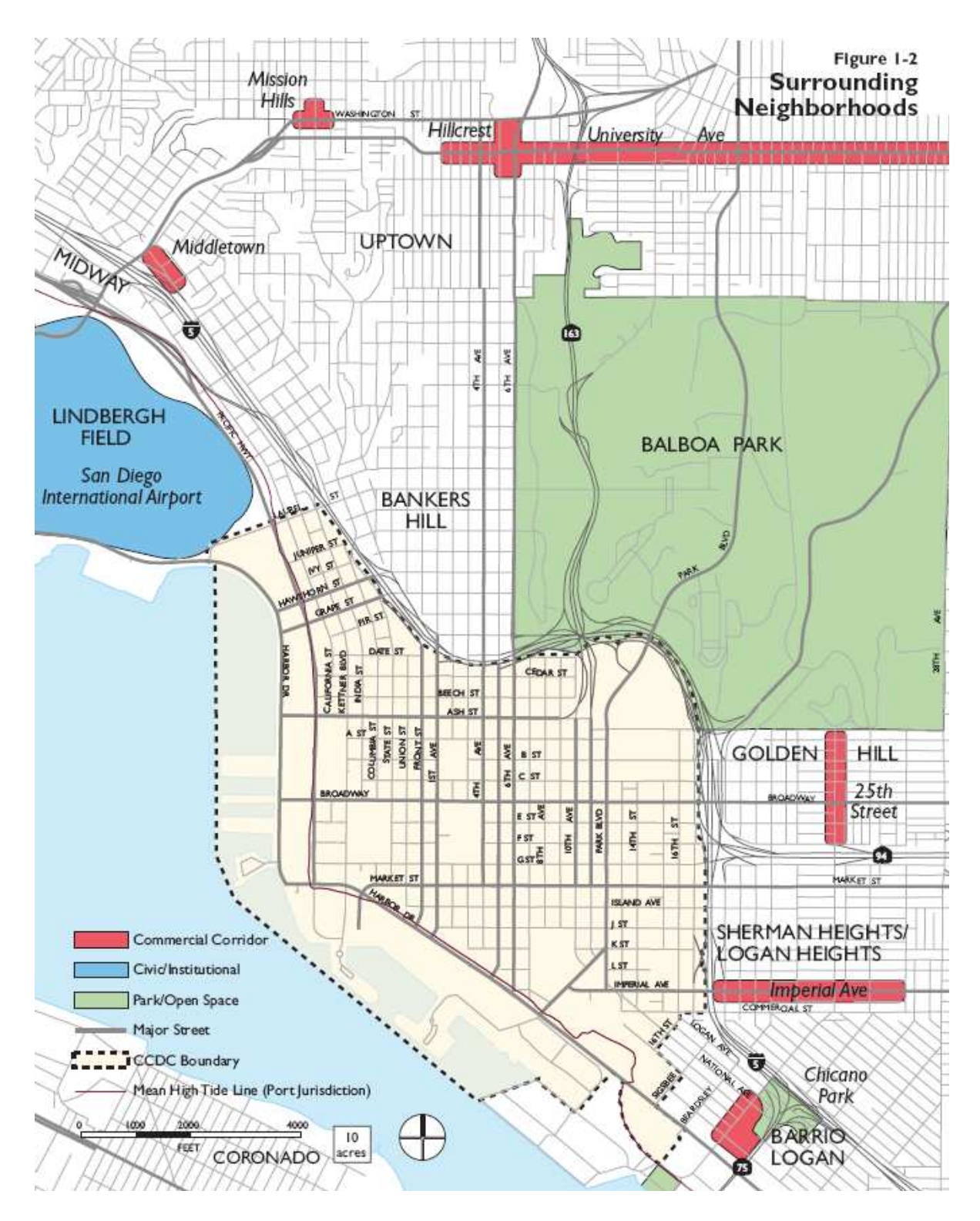
*The study area encompasses all 1,450 acres within downtown San Diego as well as historic neighborhoods to the north and east of I-5 that border the East Village.