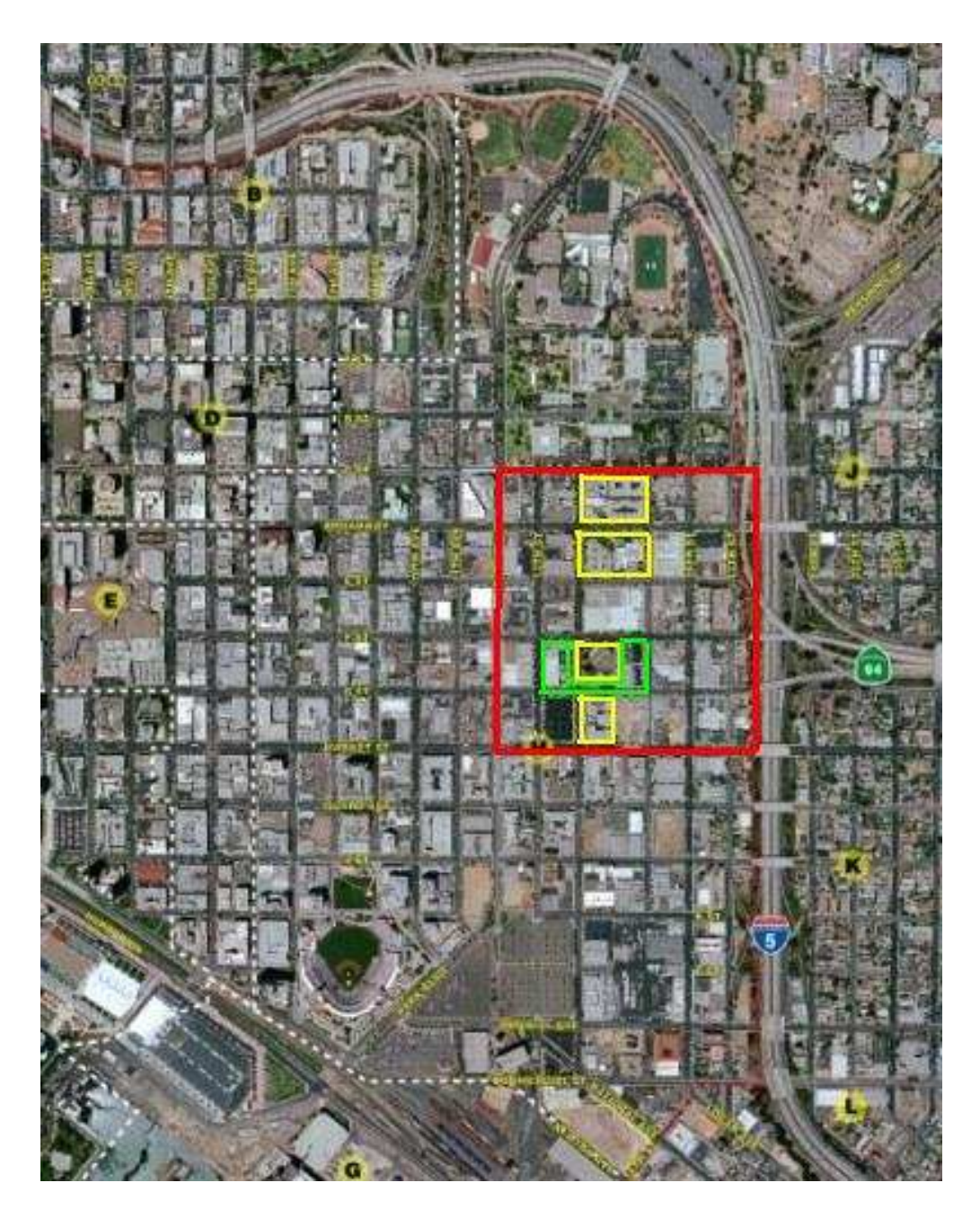
**The development site (outlined in red) encompasses approximately 73.5 gross acres (including streets) bordered by Park, C, Market, and I-5. Of note, it does not include the police headquarters located at 1401 Broadway (the entire block bound by Broadway, E, 14th, and 15th outlined in yellow), the mixed-use Albertson's at 655 14th Street (western half of the block bound by Market, G, 14th, and 15th outlined in yellow), the Union Square residential development on Broadway that has the diagonal open space to accommodate the fault line (entire block bound by Broadway, C, 14th, and 15th outlined in yellow), and the substation (northwestern corner of block bound by F, G, 14th, and 15th outlined in yellow). However, you may choose to pay to relocate the substation to use this parcel (see Assumptions). The city also has plans for a park between F, G, 13th, and 15th Streets (outlined in green) that will be built around the substation, but you are allowed to do a land swap and move this to another location within the site (see Assumptions).