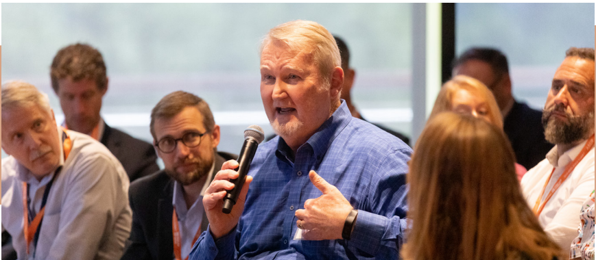
Resilience Summit attendees engaged with panelists during the day's first session, Emerging Solutions for Investors.

The speakers expect climate-related impacts as well as actions taken to be more resilient to be factored into real estate pricing in the near term.