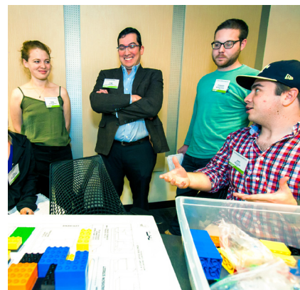
The facilitators "made us question what we were doing and why. We realized that every decision matters."