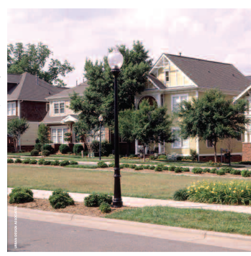
To create a sense of community, traditional town planning principles associated with new urbanism were employed at First Ward Place in Charlotte, North Carolina. The site was developed by the Bank of America Community Development Corporation and the Charlotte Housing Authority.

Widely promoting the concept of affordable housing is an important part of cultivating a hospitable environment for projects. Nonprofit housing developers, as mission-based organizations, are particularly aware of the need to generate wider acceptance in the larger community. Successful promotion techniques include demonstrating to a community the economic as well as social benefits of providing affordable housing, educating the public on the need for workforce housing, spreading the word about affordable housing success stories through local media coverage and opinion pieces, and building a local constituency to serve as an advocate for affordable housing.